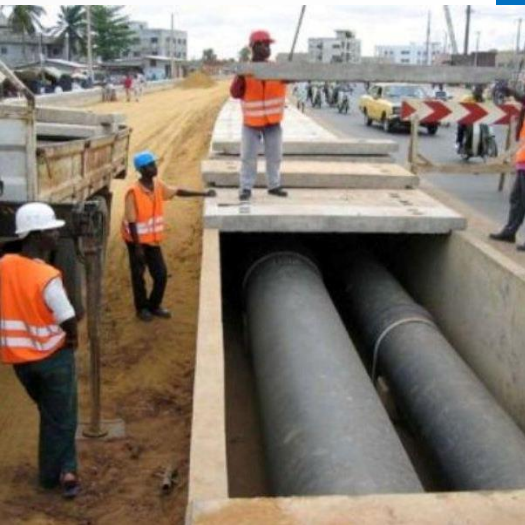
Urban works - Cotonou